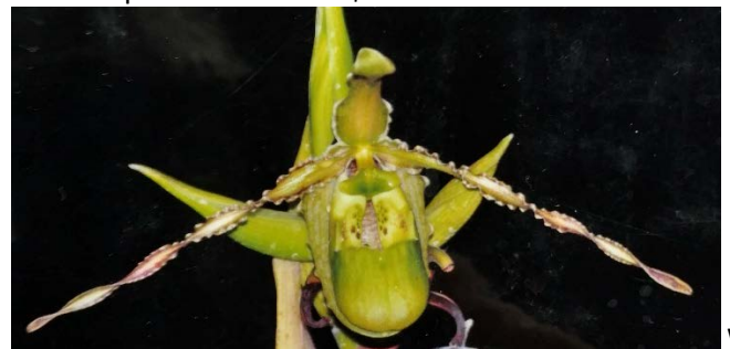
3.5-4.5" pots BS divisions $35

WSO 4696 czerwiakowianum ('Green Ghost' x sib)